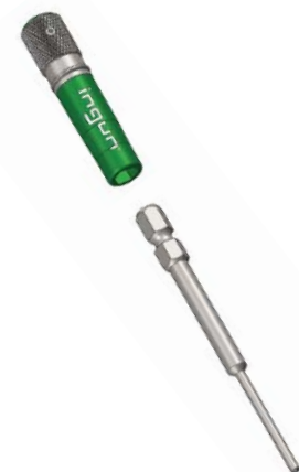
Example: DW-1-S with BIT-GKS-075 M-B