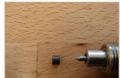
6. Manually insert the friction bearing (chamfer visible)