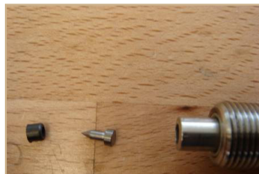
5. Manually insert the marking head