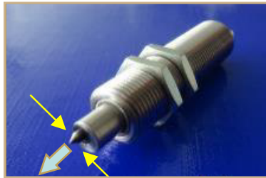
2. Remove the marking head with pliers.