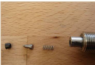
4. Manually insert the spring