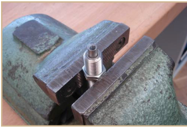
1. Place the marking unit in vice and secure at nut.